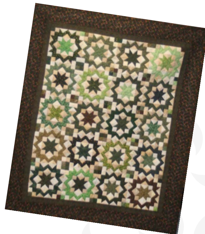
Twin-sized carpenter's wheel quilt by members of the Rock Valley Quilter's Guild.

Thanks to the members of the Rock Valley Quilter's Guild for their hard work on this project.