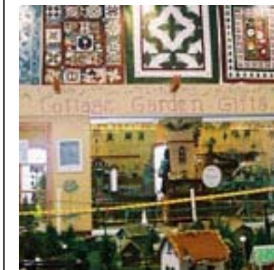
This year's show will again feature nearly a quarter-million lights, nightly trains by the Wisconsin Garden Railway Society, creations by the Rock Valley Quilter's Guild and much more!