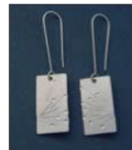
Recycled Aluminum Earrings